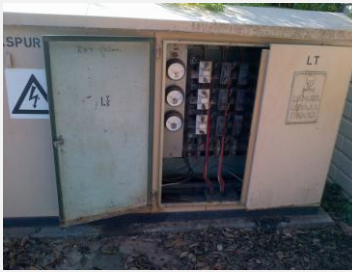
Dangerous Situation was contained

A resident called in to inform us of a suspicious B/M dressed as if he was a water meter contractor. The water contractors chased him after he hacked a main power cable, he dropped his tools and ran. However Isaac was patrolling about 20 minutes later and found him and arrested him for attempting to steal cable.